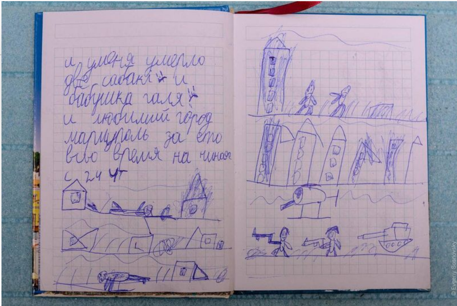
I have died 2 dogs, my Grandmother and the beautiful city of Mariupol 8 yr old boy